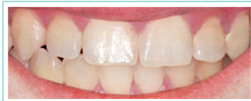
Icon removes white spots in one simple treatment, restoring the beautiful, natural look of the teeth!