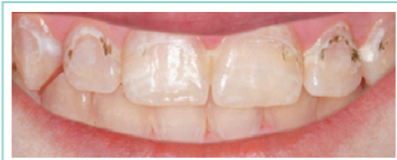
White spots before Icon treatment.

No drilling or shots of anesthetic are needed to cosmetically remove white spots with Icon. And, unlike other treatments, you only need to make one visit to the dentist!