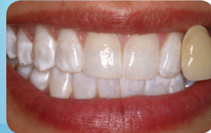
(ACTUAL PATIENT RESULTS)

For more information on KöR Whitening talk to your dentist today